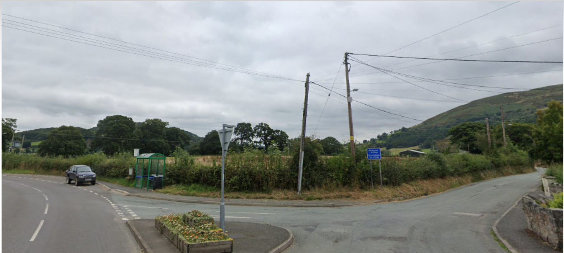
View of the site from centre of the village