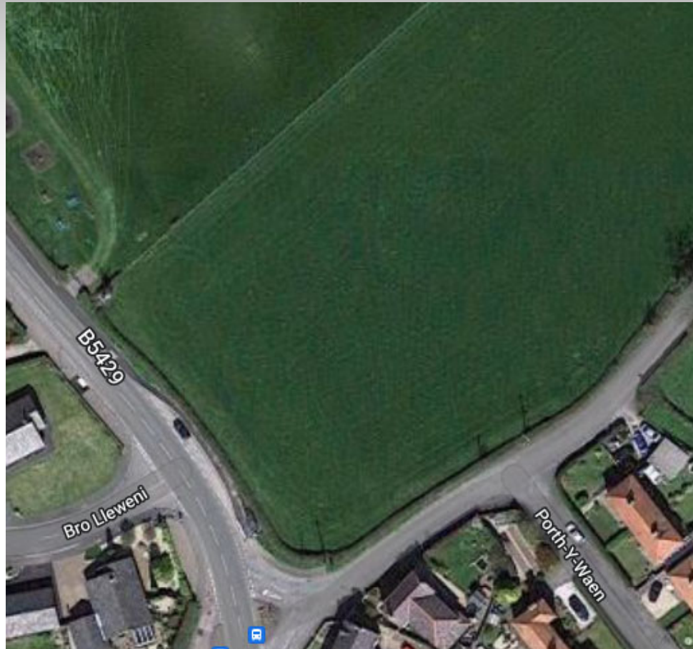
Aerial view of the site