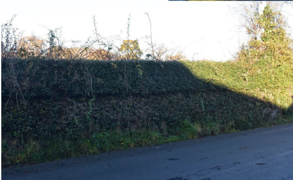
Location of access opposite Porth y Waen